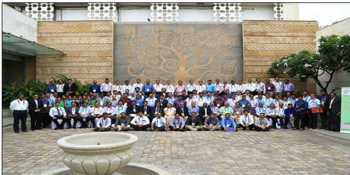
Polio Eradication Endgame: Tactical use of IPV -23rd & 24th July, 2016, Taj Coromandel, Chennai