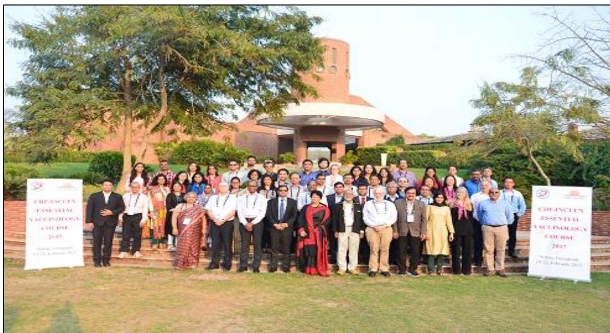
Essential Vaccinology Course, 19 th -22 nd Feb 2017 Delhi NCR