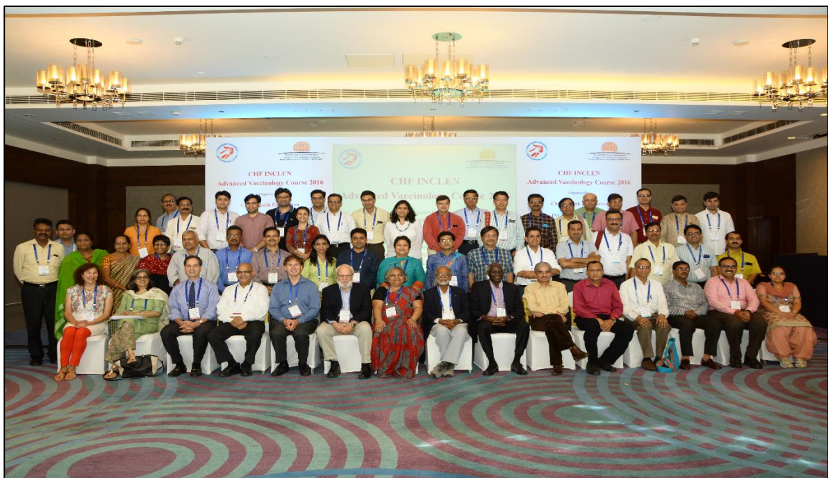
ADVAC 6th -12 th June 2016, Delhi NCR